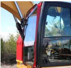
Bolts directly over OEM window.