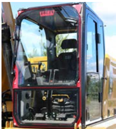
UL752 Level 1 Ballistic Window.

Heavy Equipment Armor's guarding products add another safety protection for the operator and the machine. A company's most valuable asset is protected - it's people . This reduces injuries which reduces costs and improves work quality at the same time. Being in a safe workplace not only gives you piece of mind.