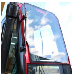
Our polycarbonate excavator windows have not been drilled or milled making it less susceptible to micro-fractures and is bonded to a steel frame making it flex less.