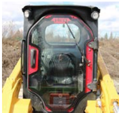
UL752 Level 1 Ballistic Door.

BE AWARE NOT ALL POLYCARBONATE IS CREATED EQUAL