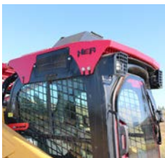
CAT Skid Steer Top Cab Guard System PART# CATD-CG (Shown with Caterpillar Cooler)