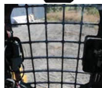
View From Inside Looking Out