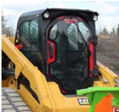
Uses current factory hardware from your original door.