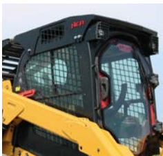
CAT Skid Steer Top Cab Guard System PART# CATD-CG (Shown without Caterpillar Cooler)