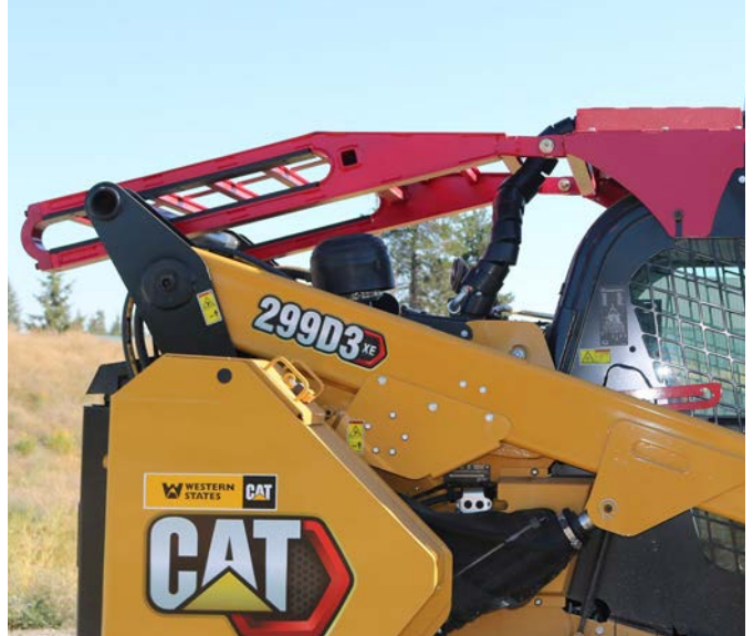
Enhanced CAT Skid Steer Guarding System PART #CATD2-EG (Long)