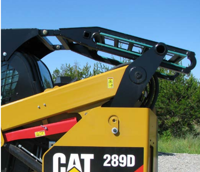
Enhanced CAT Skid Steer Guarding System PART #CATD-EG (SHORT)