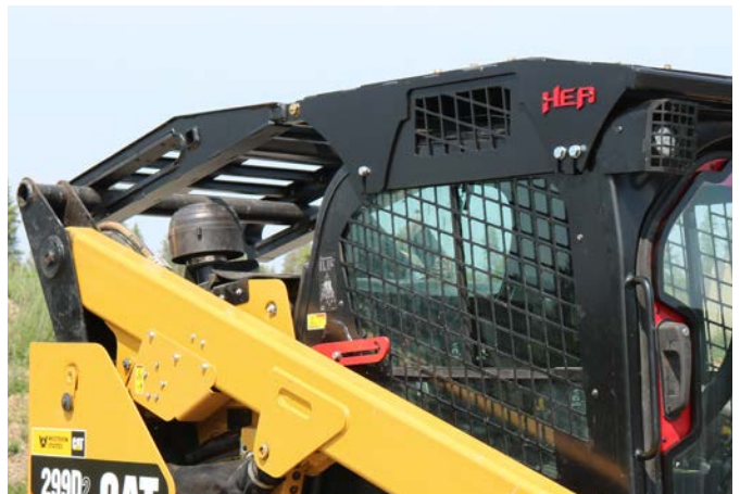
This system will fit current CAT skid steer models 262D, 279D, 289D, 289D XPS, 299D with side mount.

PLEASE NOTE: This guard is intended as a brush guard only. It is not a certified FOPS/ROPS guard.