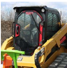
Our polycarbonate skid steer doors have not been drilled or milled making it less susceptible to micro-fractures and is bonded to a steel frame making it flex less.