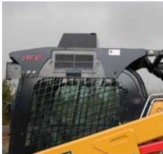
CAT Skid Steer Top Cab Guard System PART# CATD-CG (Shown with Caterpillar Cooler)