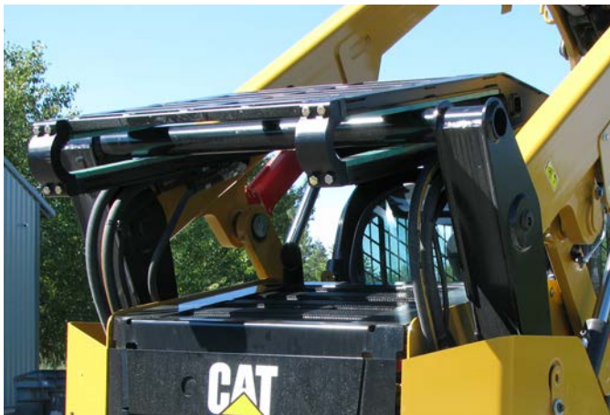
This system will fit current CAT skid steer models 226D, 232D, 236D, 242D, 246D with side mount.